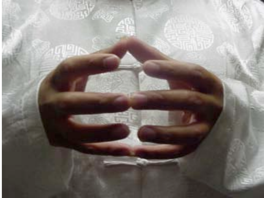
Figure 1. Pure Yang Mudra

By carefully examining the formation of the Pure Yang Mudra, we can see that it has deep roots in the Book of Changes . The Book of Changes contains 64 hexagrams. A hexagram is constructed of six lines, three on the top and three on the bottom. Each set of three lines is called a trigram. To make a mudra the fingers come together to form the two trigrams that make up the hexagram.