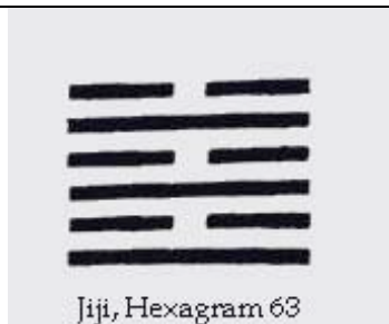
Jiji, Hexagram 63